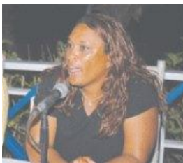
Zina Garrison Endorses the project

"It has been very nice to come to Anguilla and talk to the children who want a dream," she continued. "They asked me tons of questions...and one again I want to say to both banks thank you for taking advantage of the opportunity that these young children have now and they do have a dream. Thanks for the support and I am truly, truly a supporter of this programme and I will be there whenever you need me."