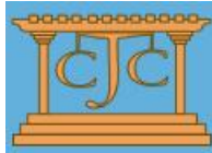
Caribbean Juris Chambers