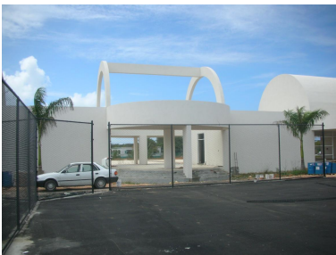
View from court one towards the palm court at the new Jeremiah Gumbs Tennis Pavilion