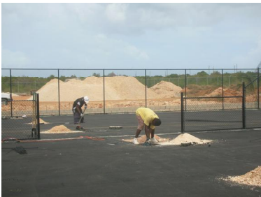
Two workers prepare to put in the net posts.