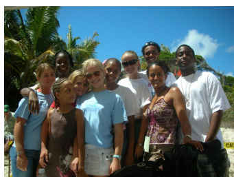
The ATA shirt selling crew!!!!

All in all, it was a beneficial weekend for the ATA. The best part is that the ATA did not have to contribute any money toward the event and therefore all money collected goes directly to the children's programmes. When the final figures are released, there will be press releases that divulge the exact figures. Keep an eye out!