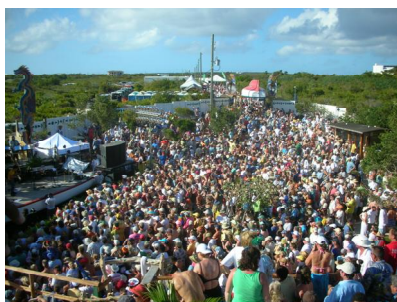
The Dune Preserve packed with Parrotheads!