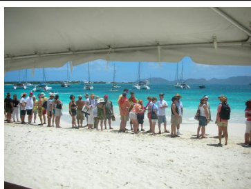
People line up on the beach to get in to the concert!

The ATA was also given a number of T-shirts to sell at Gwen's Reggae Bar on Friday before the show in which USD $500 was raised. On the day of the show, members of the ATA's elite group sold Moonsplash T-shirts to concert goers in which USD $1,865 dollars was collected. All T-shirt money went directly to the ATA's programme account which funds the after school program and the summer camp.